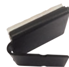
Dual Lock ® Mount

This mount is discreet and very solid for a permanent mounting location. Make sure the adhesive side of the included Dual Lock is securely fastened to the windshield before adding the weight of the detector to it.