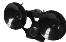
Suction Cup Mount

This is the best option for portability and moving the detector from car to car. Make sure to thoroughly clean the suction cups and windshield mounting area to insure a tight seal.